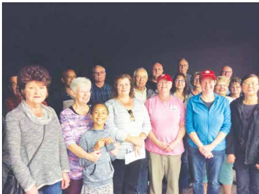
In Bloom winners gathered at Community League Day

During the winter, the market is meeting inside the Royal Canadian Kingsway Legion on Sundays, 11am – 3pm at 14339-50 St NW. This is in the Miller neighbourhood.