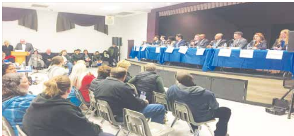
A capacity crowd of Northeast Residents listens as candidates answer questions.

Our area is represented by a Councillor, MLA and MP, and we're committed to working with all levels of government to make our community a great place to live, grow and thrive.