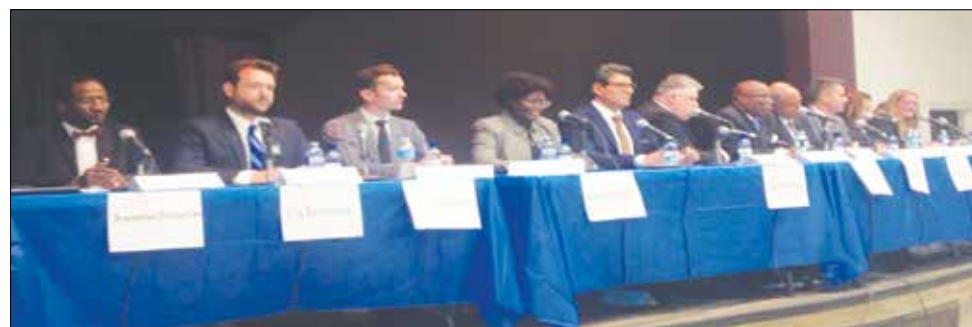
Ward 4 Candidates answer questions from the crowd.