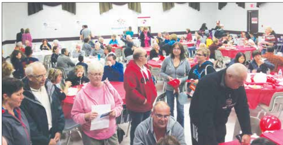
McLeod Community League Day saw an excellent turnout