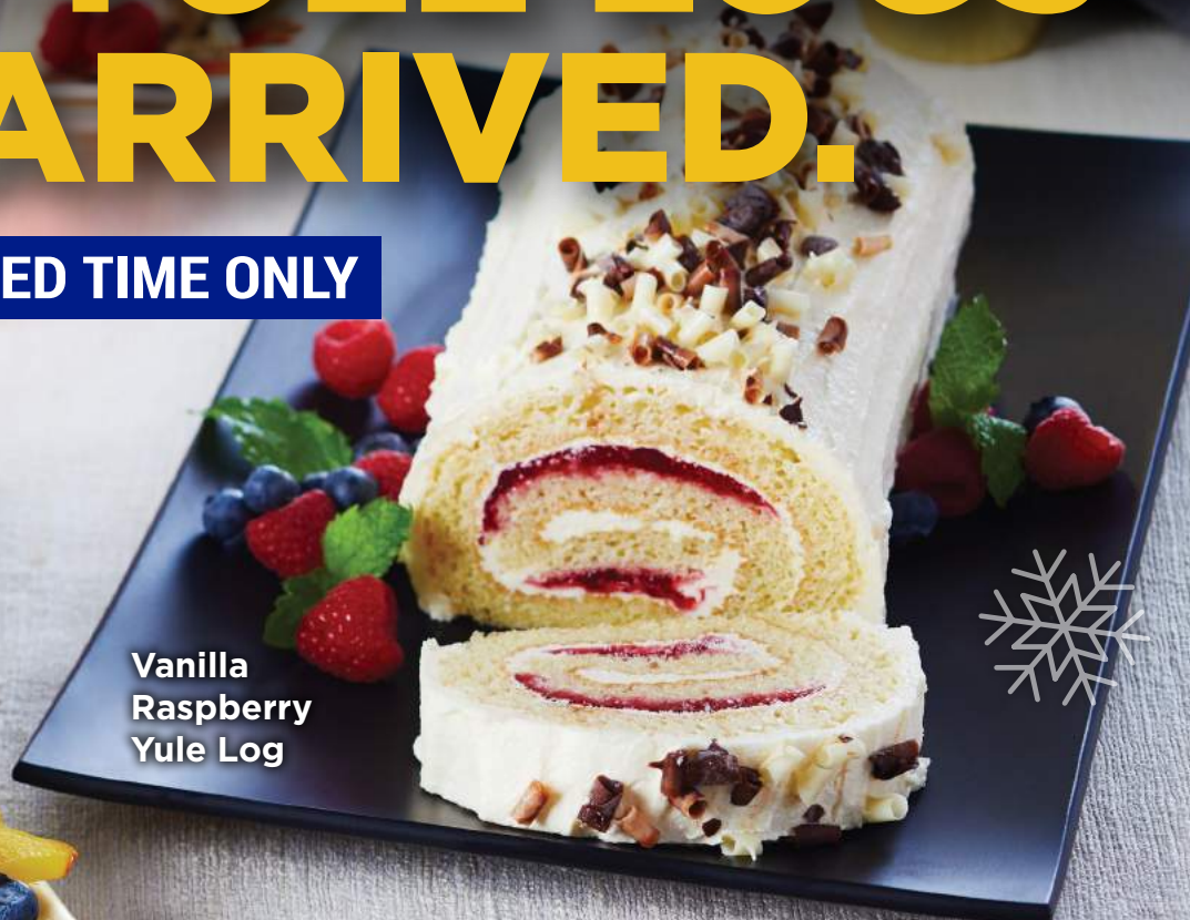
Vanilla Raspberry Yule Log