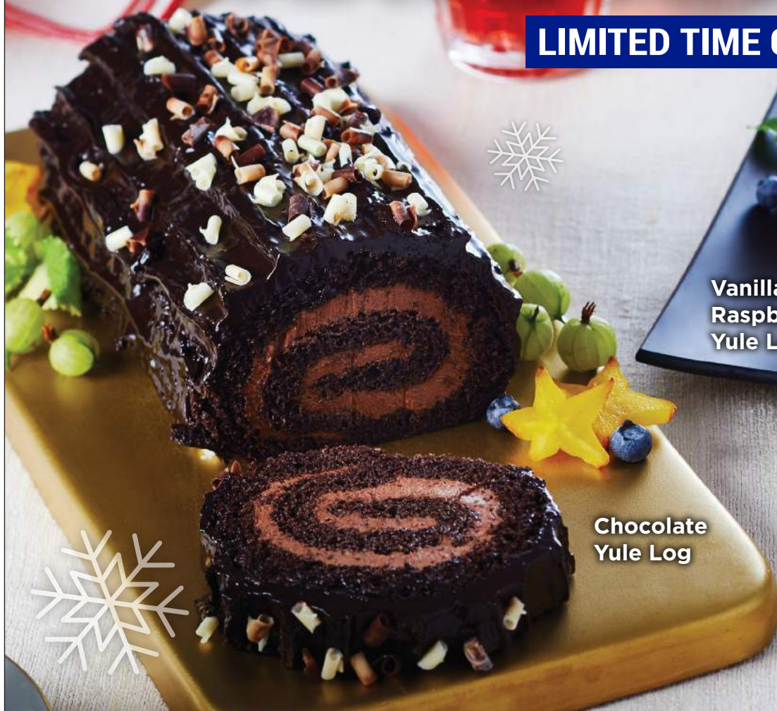
Chocolate Yule Log