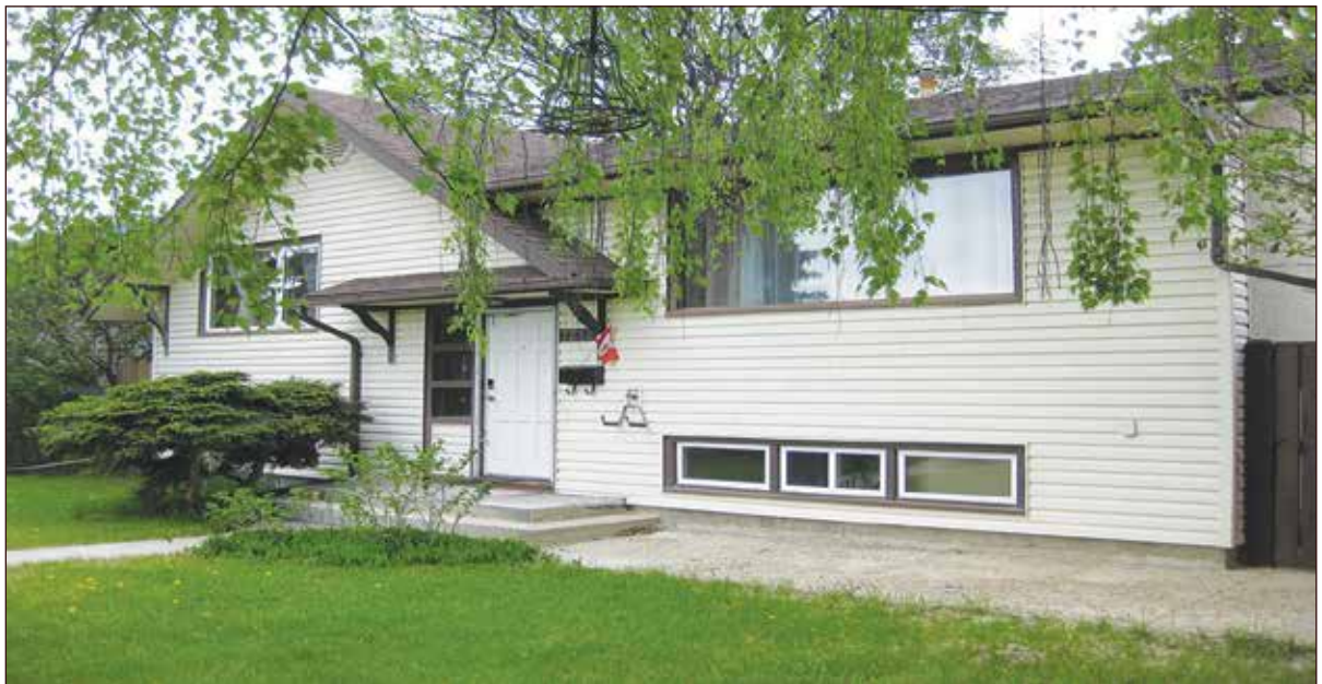
Ottewell: Recently updated Kitchen, bathroom, singles house & garage, hotwater tank, has A/C. Close to schools, shopping and public transport, quick possession available.