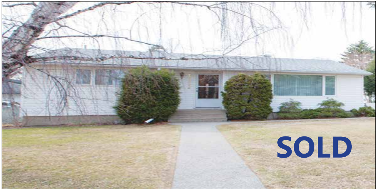
Capilano: 715 m2 lot, 1160 square foot home, OVERSIZED heated double garage, updated sewerline, triple pane windows, exposed aggregate sidewalks, really nice property on a quiet street.