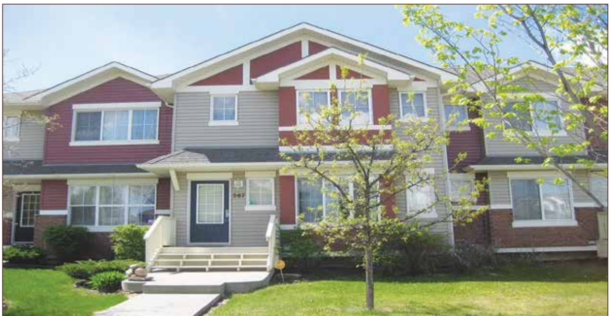
Walker: Perfect south Edmonton starter home, No condo fees, 3 Bedrooms upstairs, 3 Bathrooms ( ensuite ), fenced yard, garage pad, quick possession available.