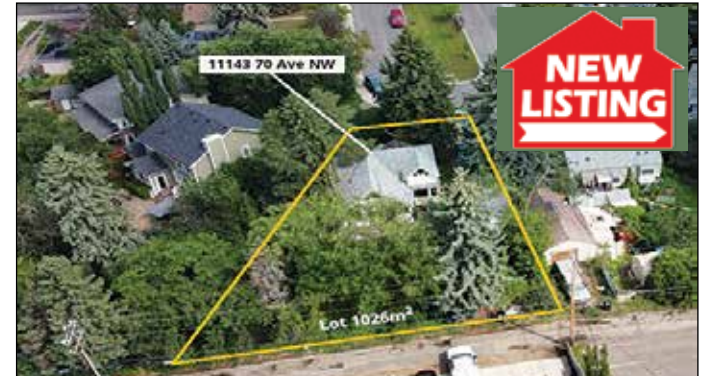
Parkallen: Prime cul-de-sac, massive 1026 M 2 lot, facing island park, redevelopment potential or renovation opportunity.