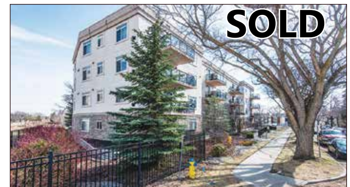
University Condo: Impressive 1200 sq ft 3rd floor unit, 2 Bedrooms, 2 Bathrooms, insuite laundry, underground parking w/storage, concrete & steel construction, pet friendly complex.