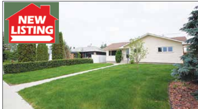
Fulton Place: Dream double garage, updated top to bottom, roof to sewer-line, basement with second kitchen.