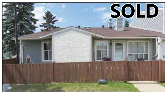
Fraser: End unit with fenced yard, no upper neighbours, 2 bedrooms + den, lot of complex updates