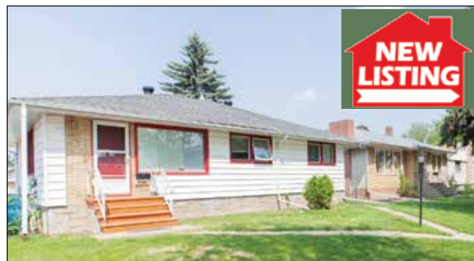
Holyrood: 2 + 2 bedrooms, newer kitchen, bathroom, flooring and roof. Basement has second kitchen (self contained living space)