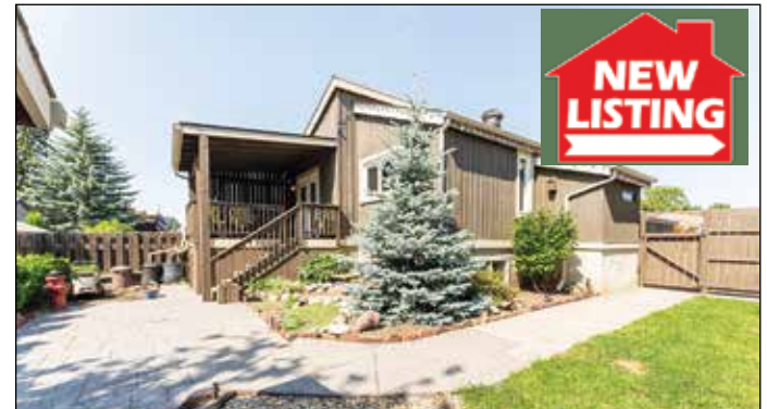
Ottewell: Bi-level 3 bedrooms plus den, 2 full bathrooms, single attached garage, RV parking, full fenced south yard, SUPER CUTE with numerous improvements over the years.