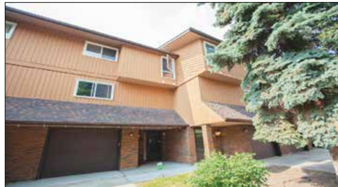
Dunluce: North Park Village. 3 Bedrooms, 3 Bathrooms, fenced yard, seperate party room. Close to trails, recen-tre, schools, playgrounds and splash park.