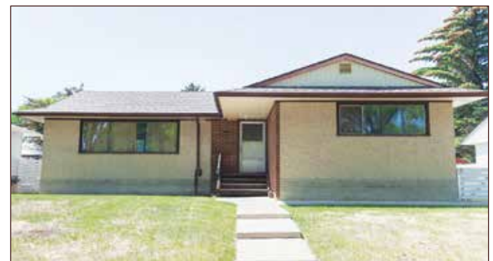
Holyrood: Quiet street. 16.4 M frontage. 745 M 2 lot. Sunny west backyard. Newer 24' x 24' garage with spacious parking pad. Updated bathroom and kitchen.