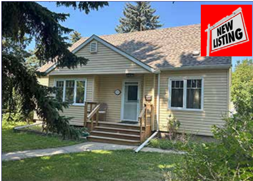
Parkallen: Nice curb appeal, Quiet tree lined street, 3 bedrooms, 2 bathrooms, 15.2 x 39.7= 604 m2 lot, Fenced yard, Nicely maintained home.