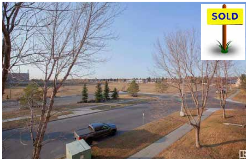
Millwoods: Entry Level Condo, Low Condo Fee $298, Insuite Laundry, Newer Flooring and Paint, Nice View of Park.