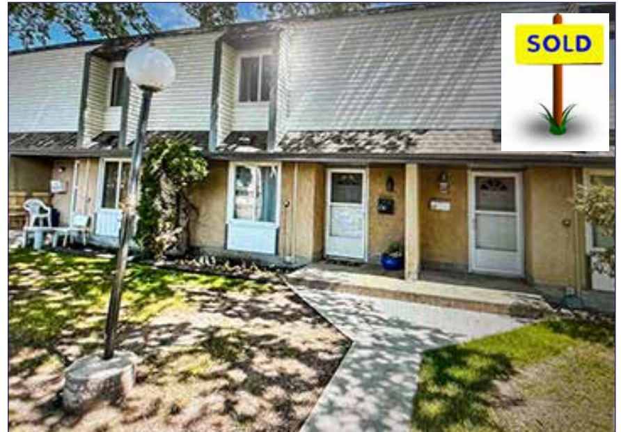
Duggan: Townhouse, 1280 sq ft, Totally renovated, Functional layout, Large rooms, Fully fenced yard, Excellent complex.